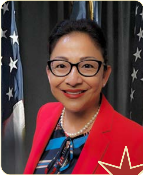
VIRNA LUKE PUBLICRELATIONS @ALAFL.ORG

Welcome to the new year. The “A Passion for Veterans” theme embodies the heart of our mission: honoring, supporting, and advocating for our nation’s heroes. Now, more than ever, we’re inviting units to take that passion online. When we tell our stories, we grow our impact. By showing our service in action, one post, one photo, and one veteran’s story at a time, we build awareness, engage current members, attract future volunteers, and inspire our communities. Whether your unit is large or small, tech-savvy or just learning, you can make a difference with just one post a week. To help units get creative, we’ve curated fresh post ideas and interactive content that align with this year’s theme. From spotlights to challenges and trivia, there are countless ways to engage with your members and the public while highlighting the passion behind what we do.