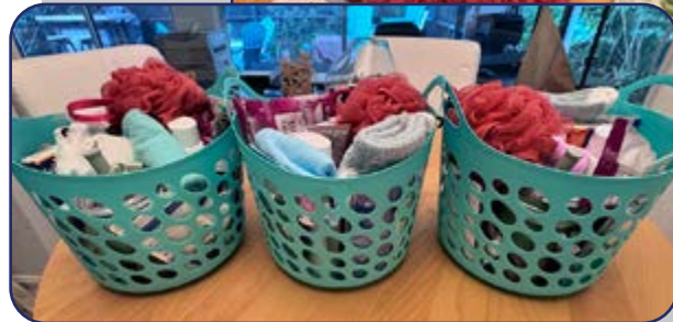
When President Sharon Sir of Unit 270 Port Orange was told that the Barracks of Hope is housing 3 female veterans she went out and purchase 3 welcome baskets and filled them up with needed goodies shown in picture