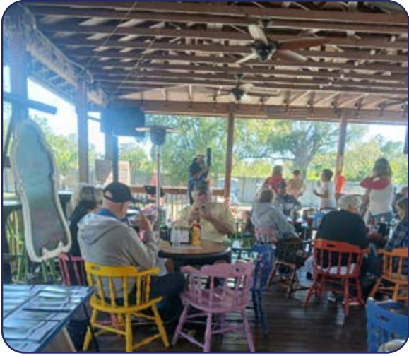
Unit 336 Deck Party, 1/4/2025 for ARC. Wonderful Afternoon. #buildingthehouse, #membershipisthekey