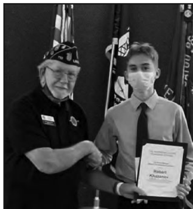
District 16: District 16 Legion Oratorical Contest Saturday, January 29 at Legion Post 252

District 5: Here is the corrected article for the Mail Call from The Mighty 5th District: