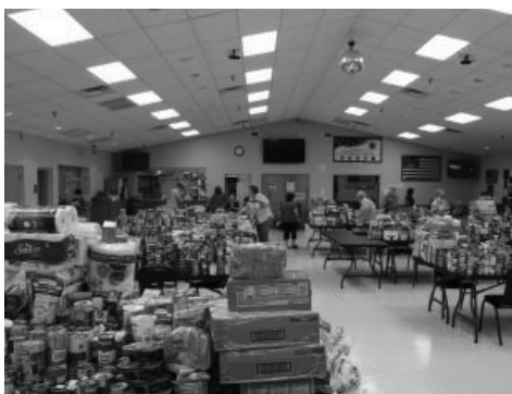
Volunteers sorting the donations

Unit 318: On August 18, 2020 we held a drive-by 90th birthday for a WWII veteran, he was so excited to see the Legion Riders on their bikes!