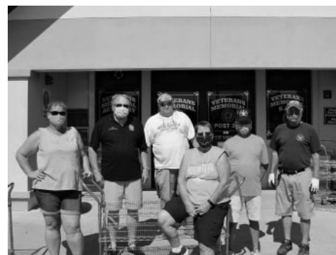
All the volunteerst donations

Unit 347: It was a pleasure and honor to be part of a food drive at American Legion Post 347 in Lady Lake with the Legion Family. We had 34 volunteers from the Legion, Auxiliary, Sons and Riders. A huge thank you goes out to all of them.