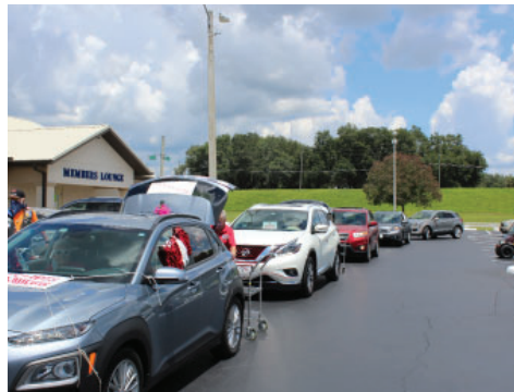
The Village Cheerleaders lined up with donations