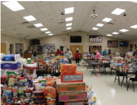
Volunteers sorting the donations

Unit 318: On August 18, 2020 we held a drive-by 90th birthday for a WWII veteran, he was so excited to see the Legion Riders on their bikes!