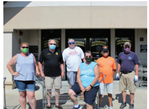
All the volunteerst donations

Unit 347: It was a pleasure and honor to be part of a food drive at American Legion Post 347 in Lady Lake with the Legion Family. We had 34 volunteers from the Legion, Auxiliary, Sons and Riders. A huge thank you goes out to all of them.