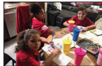
Working & coloring for the ALA