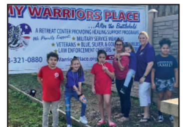
CAMP 2021 MWP