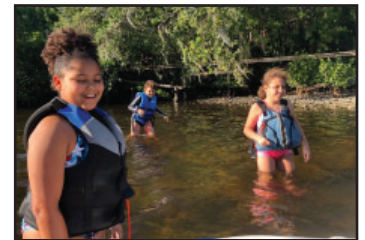
Fun on The Little Manatee River