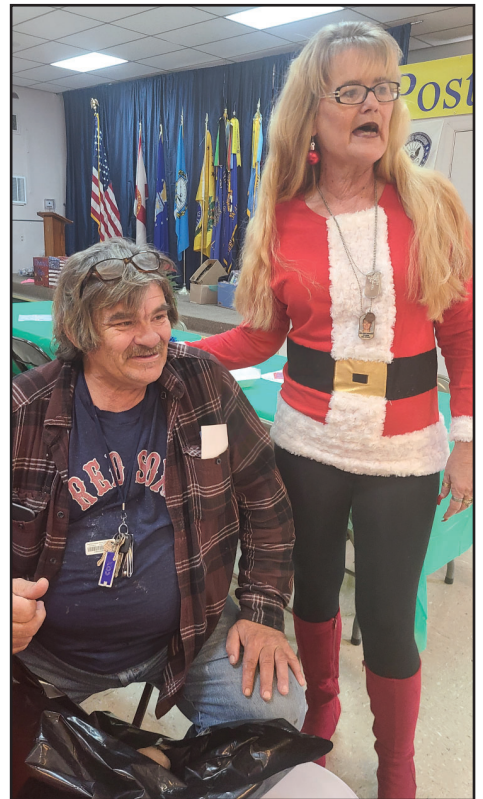
Unit 166 - Gainesville, Blessing Buckets Nov 28