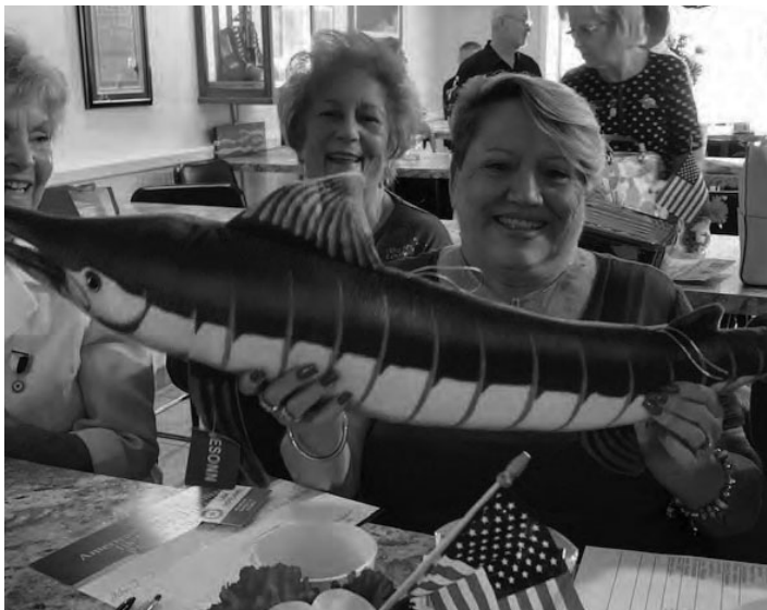
Submitted by Sue Craft