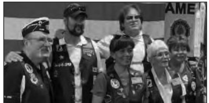
Legion Post 14 Riders Officers