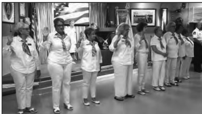
Wednesday, July 7, 2021 Installation of Officers at American Legion Post 273, Madeira Beach. Congratulations to all! We are a family working together for all Veterans.