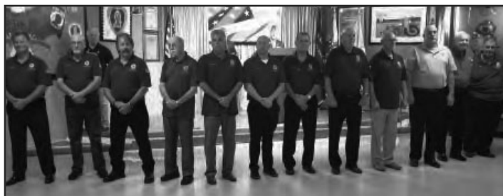
Installation of Sons of American Legion Post 273