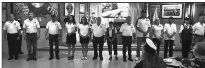
Installation of American Legion Post 273 Riders