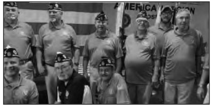
Legion Post 14 Officers