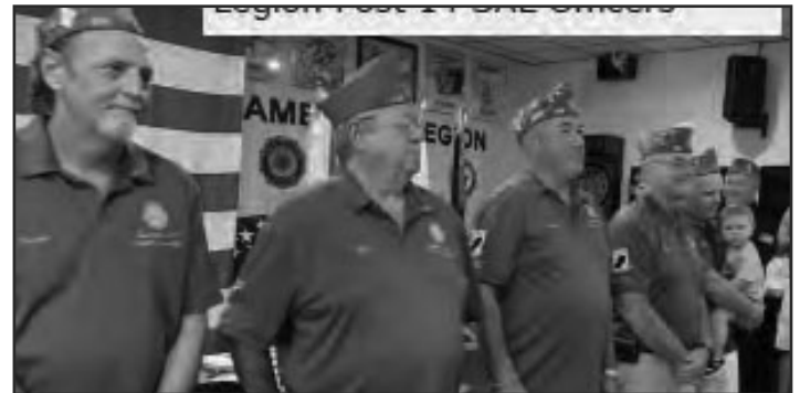
Legion Post 14 SAL Officers