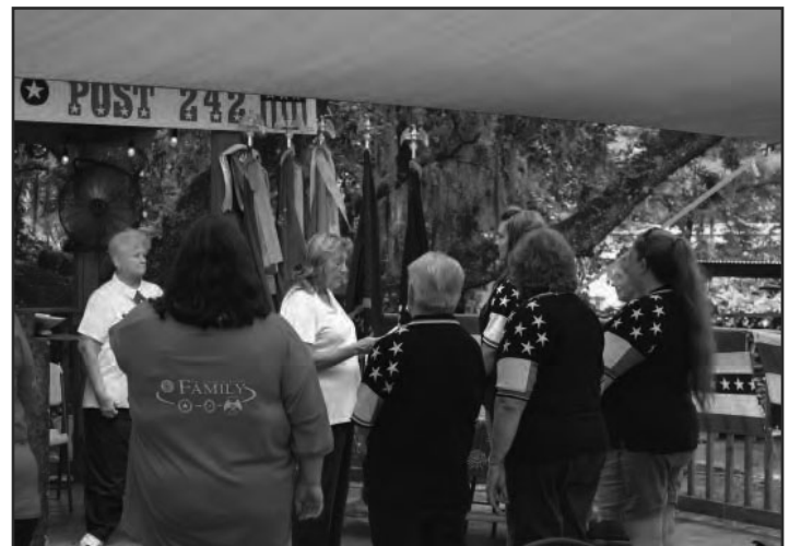
Unit 242 Installation submitted by Charlotte Bass.