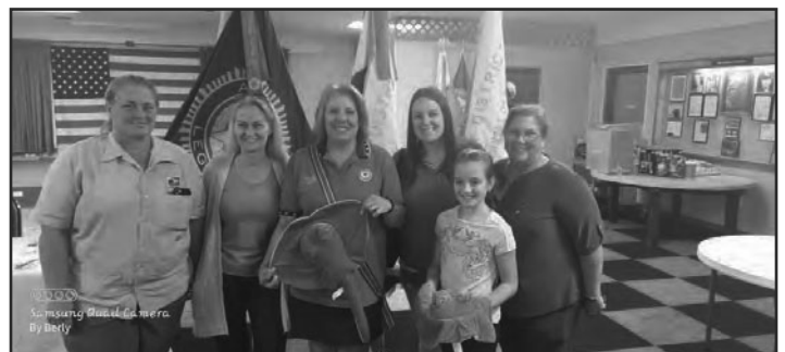
Unit 235 Installation submitted by Kim Edens.