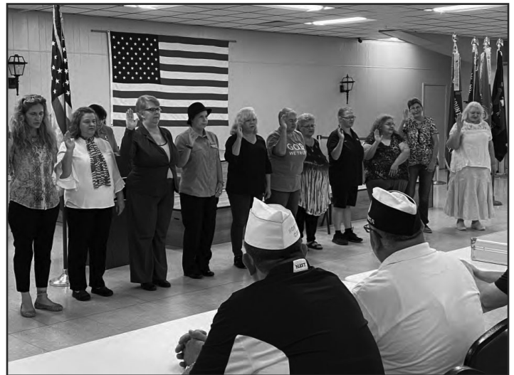
Unit 57 installation Tuesday evening