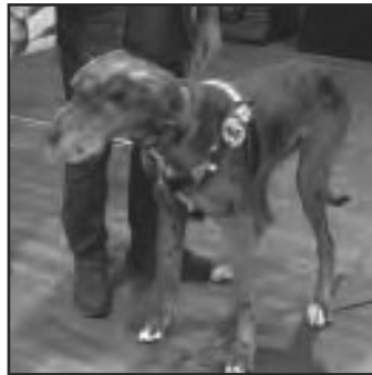
Riders Mascot 7 mos. Great Dane puppy