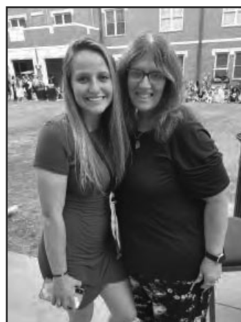
Girls State 2021