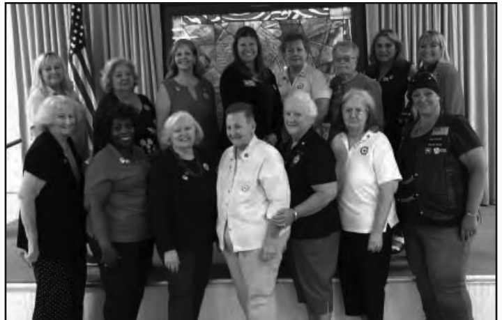
District 15 Unit 5. Where we had a meet and greet tea, made luminaries and toured their cemetery. They also shred their history .