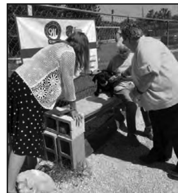
District 15 National Presidents visit from Unit 99 of the hall, decorations, caregivers, group picture and her ride with ALR escort to the next stop .