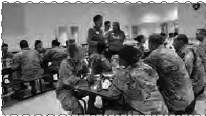
District 11 - We kept everyone busy! Unit 141 , Palm Beach County and Unit 277 , Boca Raton served lunch to the service members of the National Guard at the West Palm Beach Armory. Everyone worked very hard but was dedicated to our mission this year!