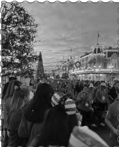
Unit 55 - Main Street Disney World

The opportunity to follow through on our yard sale goals and to see who benefitted from all our efforts was truly priceless and certainly something that won't ever be forgotten.