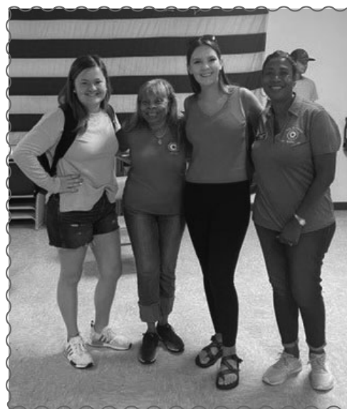
Unit 194 - Attending Girls State send off at Post 316