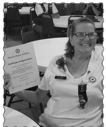
Unit 148 - Installation of new members. Unit 148 welcomed 17 new members. National Dept visits. Fathers day dinner and Installation of New Officers for 2022-2023.