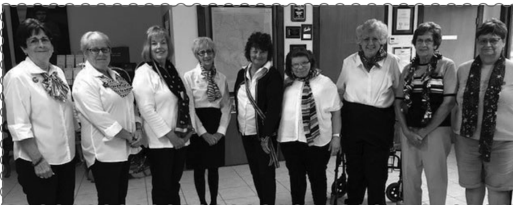
Unit 13 - Unit 13 Installation of Officers.