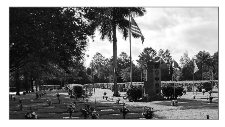
THE AMERICAN LEGION AUXILIARY, DEPARTMENT OF FLORIDA