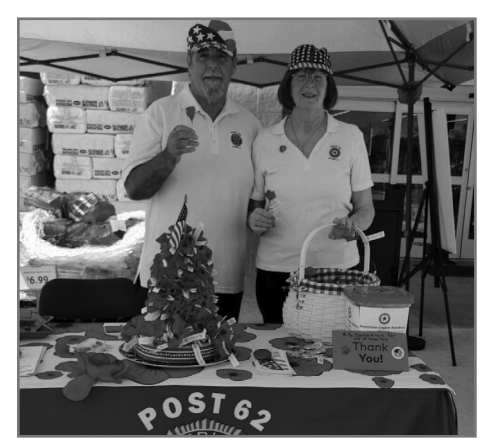
Unit 62 - Unit 62 dist 11 had around 40 members walk in the Stuart parade on Memorial Day. Our little Miss Poppy past and present lead the way for us. Members handed out poppies, flags and flag etiquette pamphlets to parade spectators. Submitted by: Jamie Schoonover

Unit 62 - Saturday May 27 and Sunday May 28 unit 62 dist 11 handed out poppies at a table set up at the new Tractor Supply Co. in Palm City. Submitted by: Jamie Schoonover