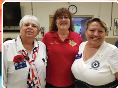
16th District - Unit 79 New Port Richey