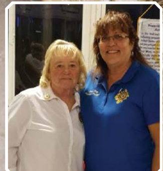
11th District - Unit 64, Boynton Beach with President Agnes