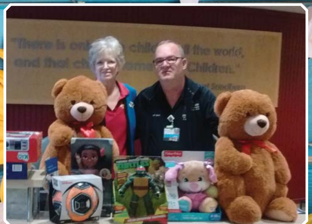
UNIT 335: All Children's hospital was thrilled with the donation of toys and teddies by Hudson Unit 335.