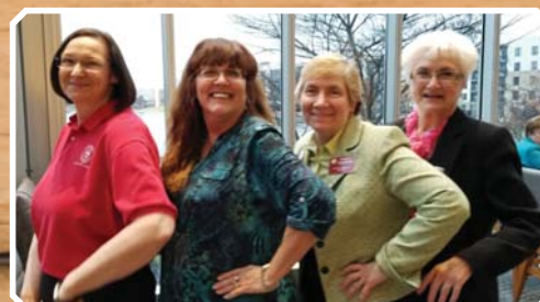
NEC Meeting - Past National Presidents