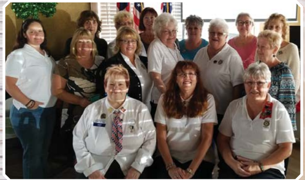
11th District - Unit 62, Stuart