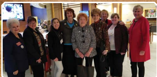
NEC Meeting - Past National Presidents