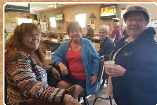
16th District - Unit 238 Safety Harbor