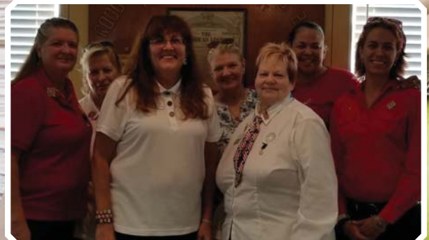
11th District - Uit 271