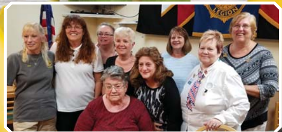
11th District - Unit 277 Boca Raton