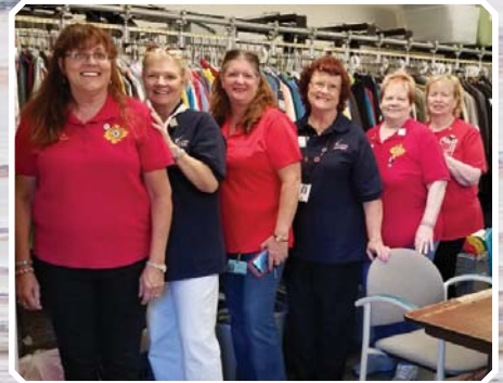
11th District - West Palm Beach VA