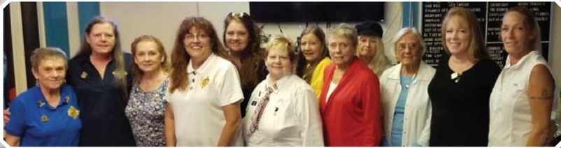
11th District - Unit 47, Lake Worth