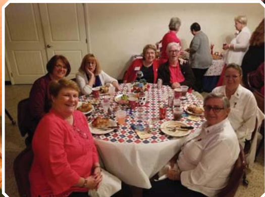
16th District - Unit 14 Dept President Dinner