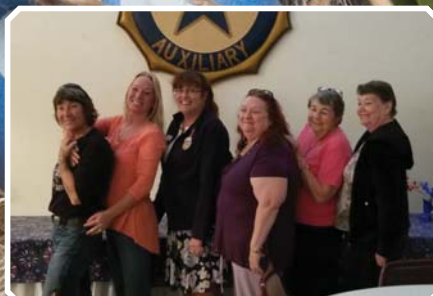
16th District - Unit 14 St. Pete