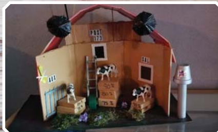
16th District - Unit 73