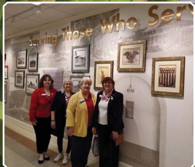
16th District - Bay Pines VA