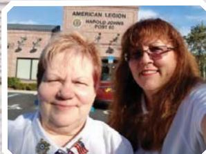
11th District - Unit 2, Stuart