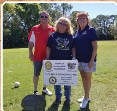
Golf Tournament Sponsoring My Warriors Place