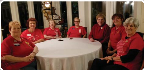
11th District - Renewal Coalition