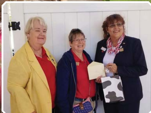
16th District - Unit 119 Largo