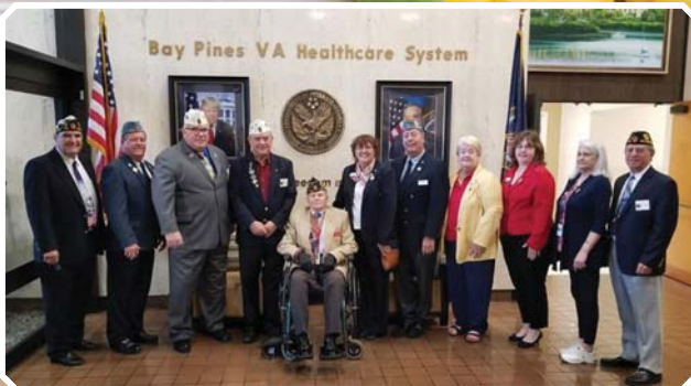
16th District - Bay Pines VA