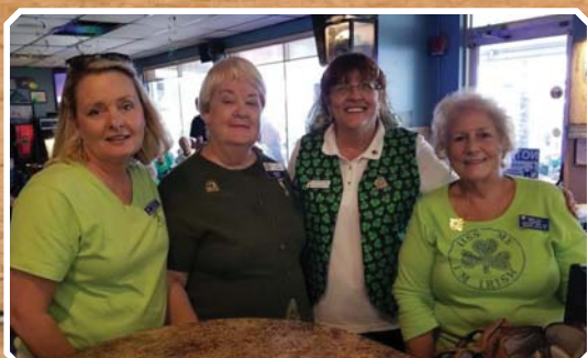
16th District - Unit 273 Madeira