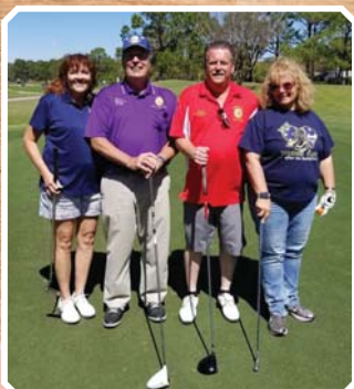
Golf Tournament Sponsoring My Warriors Place