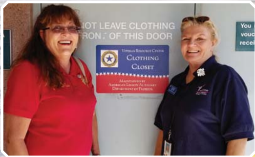
11th District - Unit 47, Lake Worth