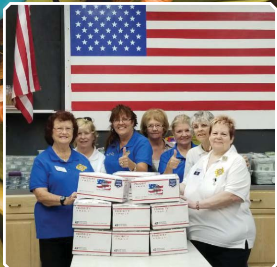
FSO Boxes with Unit 65