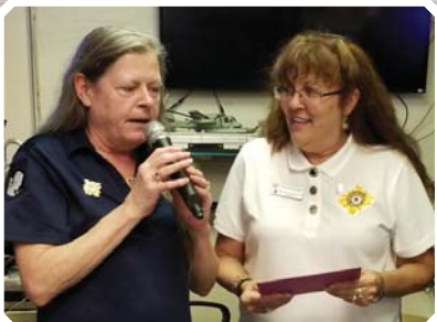
11th District - Unit 47, Lake Worth