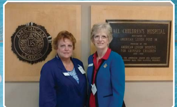
UNIT 335: All Children's Hospital