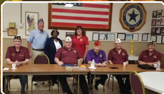
16th District - Unit 79 New Port Richey