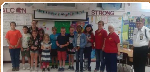
Middleburg Unit 250 Americanism Essay School Awards to Shadowlawn Elementary