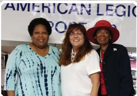
11th District - Unit 199, West Palm Beach