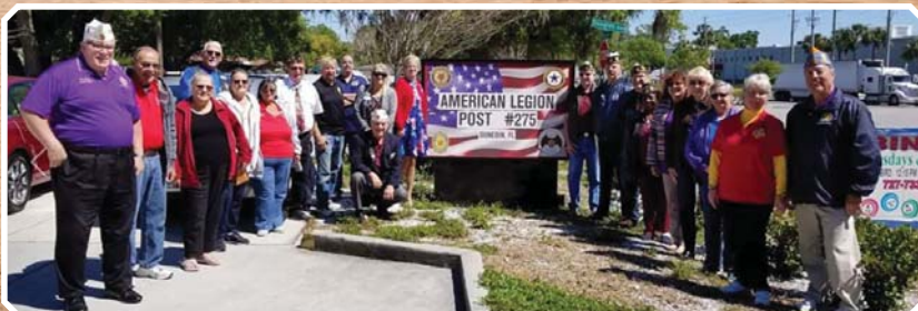
16th District - Unit 275 Dunedin