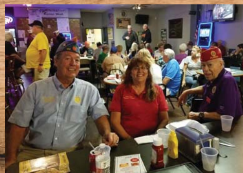
16th District - Unit 173 Holiday