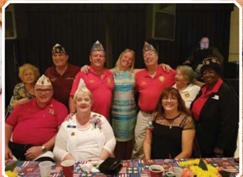
16th District - Unit 14 Dept President Dinner