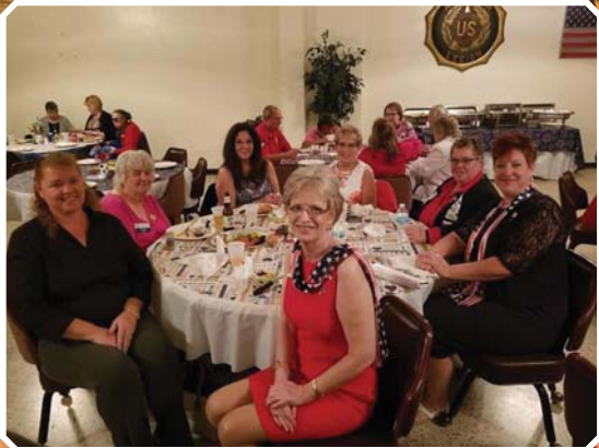
16th District - Unit 14 Dept President Dinner