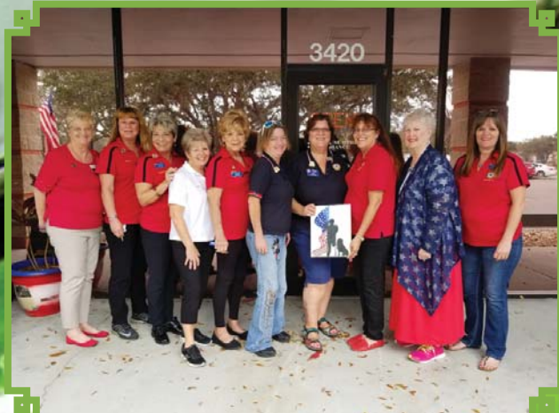
Ellenton Unit 325