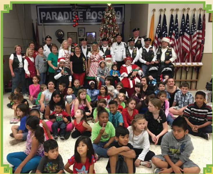
Paradise Unit 79 hosted Breakfast with Santa in conjunction with the AL Riders for 65 children from the Pasco County Foster and Adoption Agency on December 16, 2017