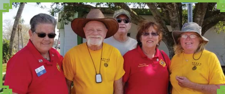
District 13 Visit