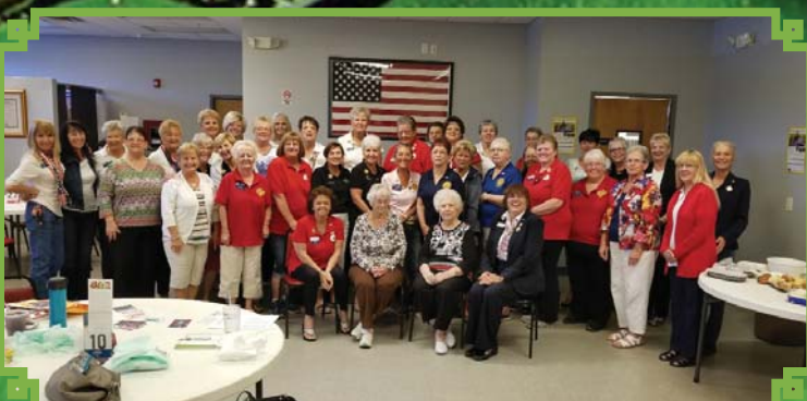
District 13 visit