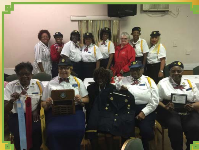
Unit 199 Miami proudly displaying their accomplishments serving the Community, Children and our Veterans.