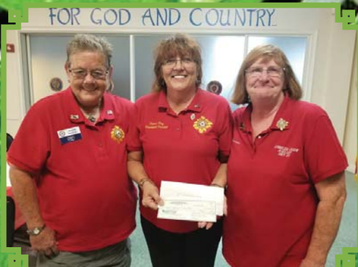
Punta Gorda Unit 103