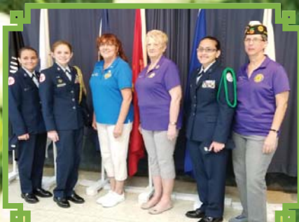
Avon Park 69 w/ Air Force JROTC