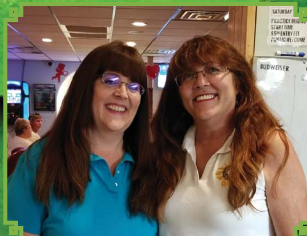
TK's "Twin" BB