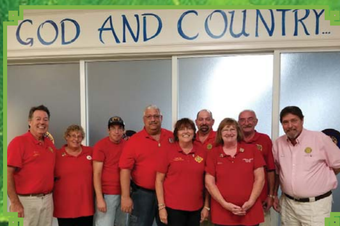
Punta Gorda Unit 103