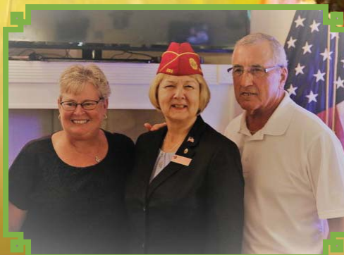
Post 164: we were honored with the visit of the National Commander, Denise Rohan. Our Post had a recognition ceremony of the Past Commanders of Post 164. Our Auxiliary helped with the dinner and photographs and welcomed the National Commander.