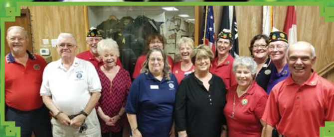
Rotunda West Unit 117