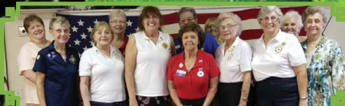
Unit 136 St James City