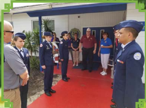
Avon Park 69 w/ Air Force JROTC