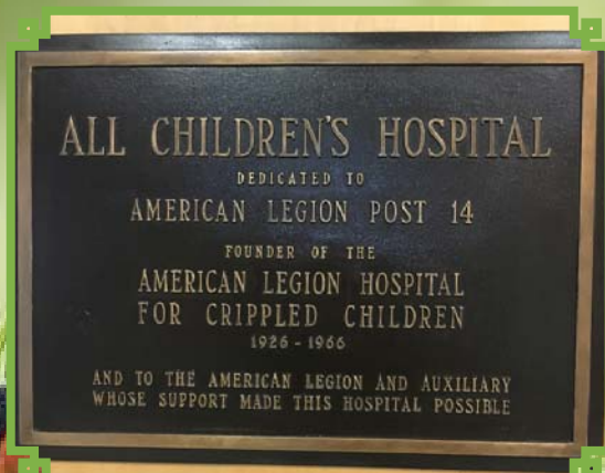
This plaque proudly hangs in the new John Hopkins childrens Hospital in St Petersburg