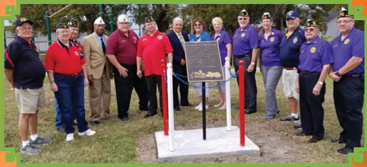
Wauchula WWI Memorial