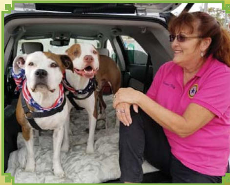
Tonka and Browser