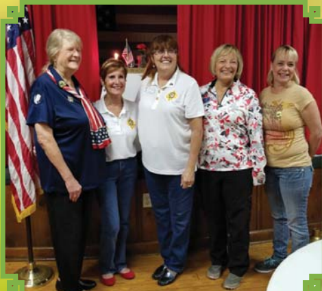
Ormond Beach Unit 267