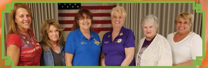
Lake Placid 25