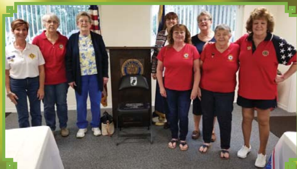
South Daytona Unit 361