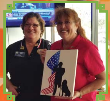
K9s for Warriors Painting