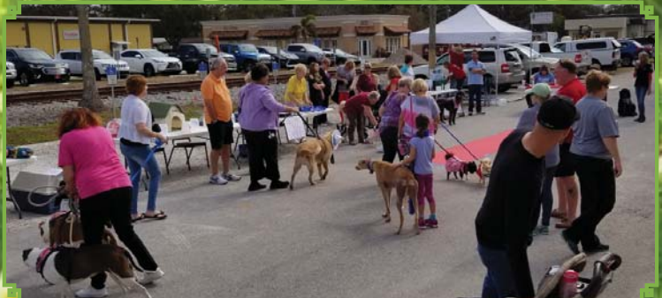
Wags for Warriors Unit 238