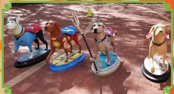
Lake Placid 25