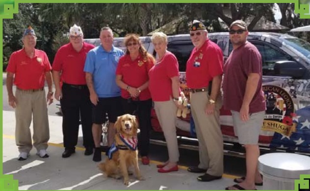
Southeastern Guide Dogs