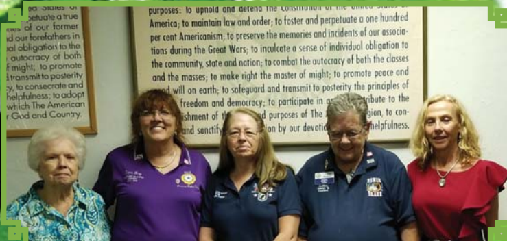
Unit 38 Fort Myers