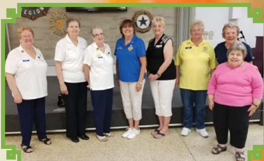
Unit 24 Bradenton