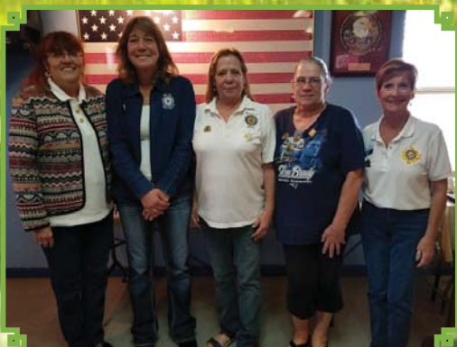
Holly Hill Unit 120