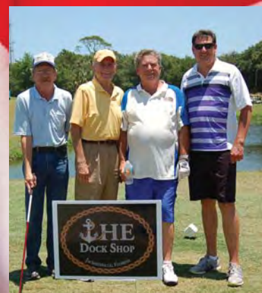
Unit 129: Girl and Boys State Golf Tournament