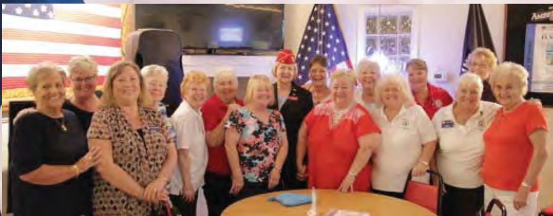
Post 164: Recognition ceremony of the Past Commanders of Post 164. Our Auxiliary helped with the dinner and photographs and welcomed the National Commander.