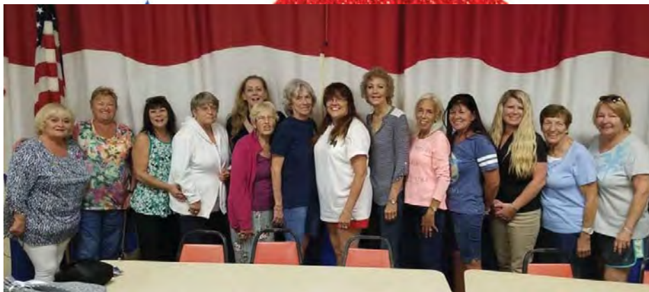
Marathon Unit 154