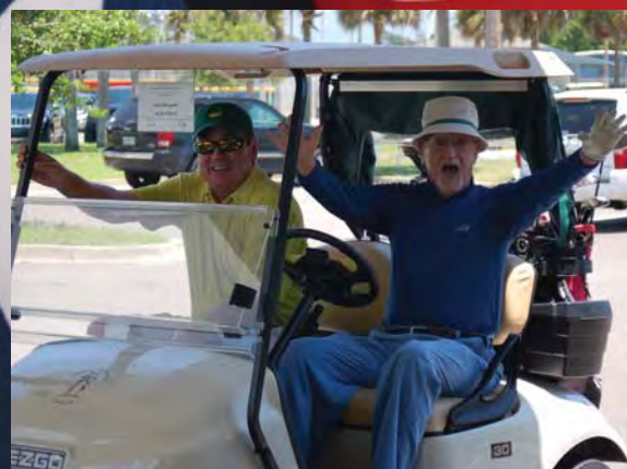
Unit 129: Girl and Boys State Golf Tournament