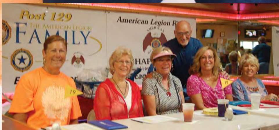
Unit 129: Girl and Boys State Golf Tournament