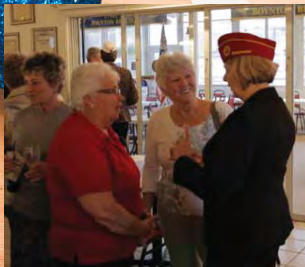
Post 164: Recognition ceremony of the Past Commanders of Post 164. Our Auxiliary helped with the dinner and photographs and welcomed the National Commander.