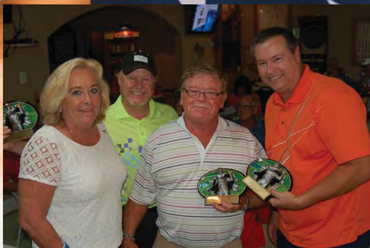
Unit 129: Girl and Boys State Golf Tournament