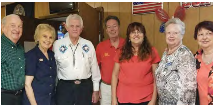
Unit 98 Coral Gables