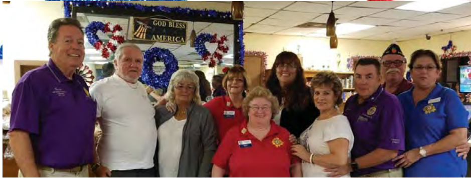
Dinner Unit 157 Margate