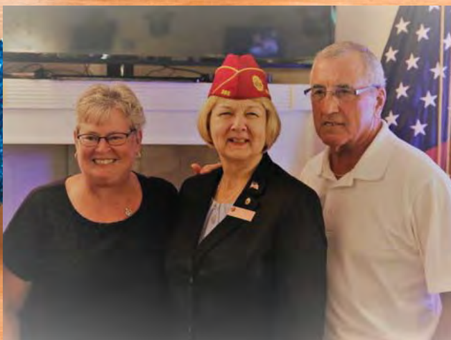
Post 164: Recognition ceremony of the Past Commanders of Post 164. Our Auxiliary helped with the dinner and photographs and welcomed the National Commander.