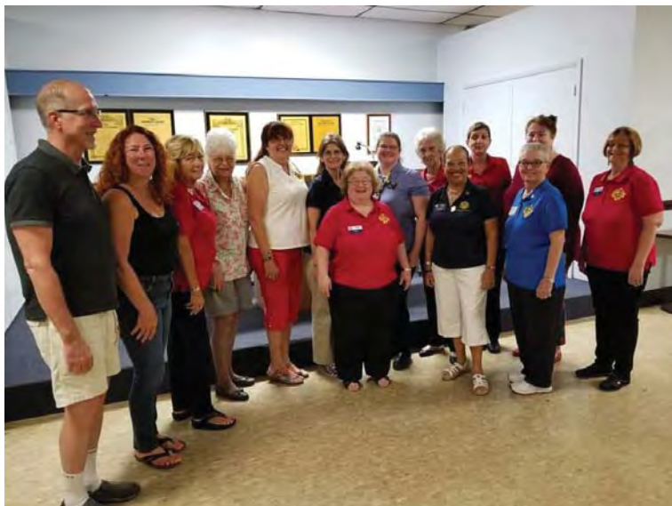
District 9 Sunday Breakfast