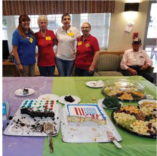
Visit to Sandy Niningar