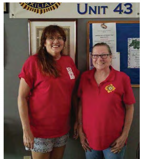
Homestead Unit 43