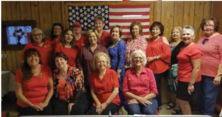
Unit 31 South Miami