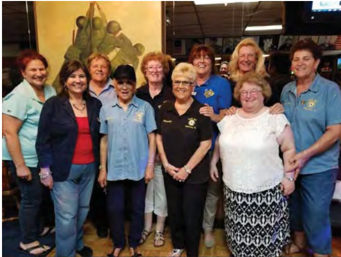
Dinner with Unit 92 Hollywood and Unit 304 Dania