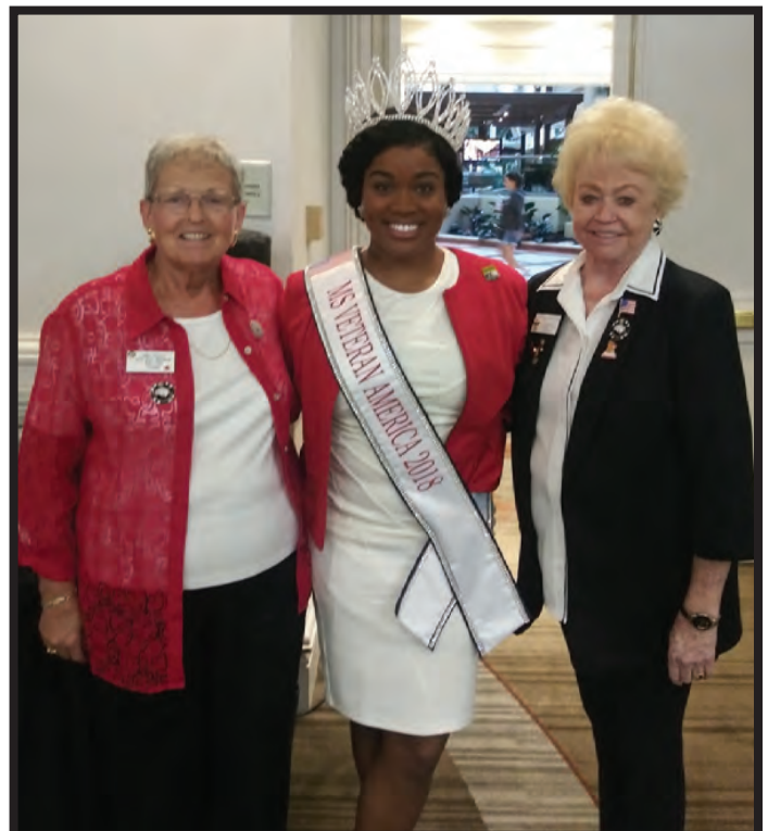
Ms. Veteran America 2018