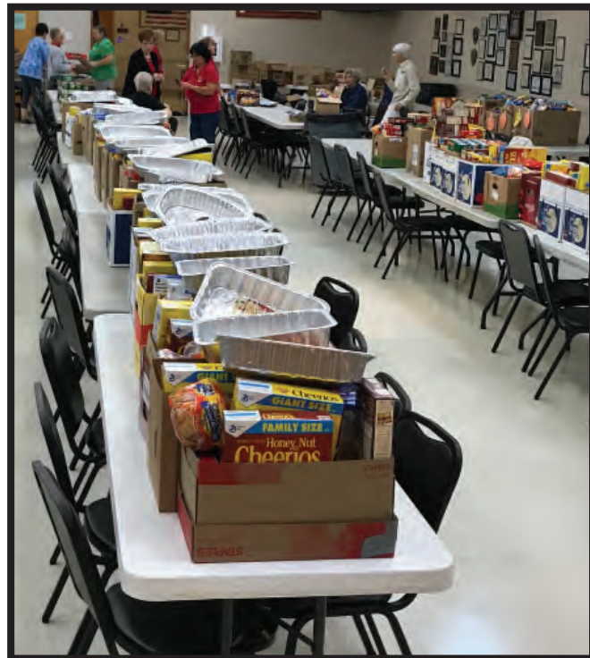
UNIT 347: A wonderful group of ladies from unit #347 spent the entire day separating food to make 76 food baskets for needy families from 3 different schools in our area.