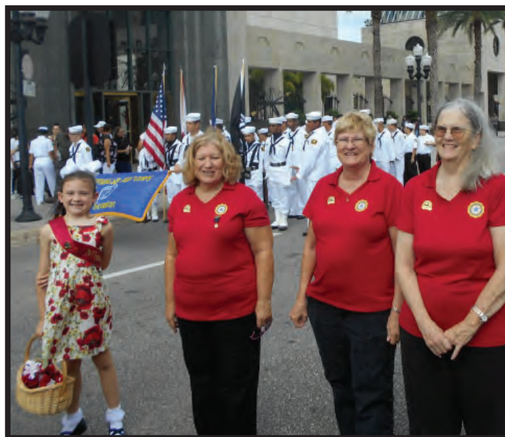
UNIT 19: Orlando Veterans Day Parade. ~Submission by Kathy Derouin