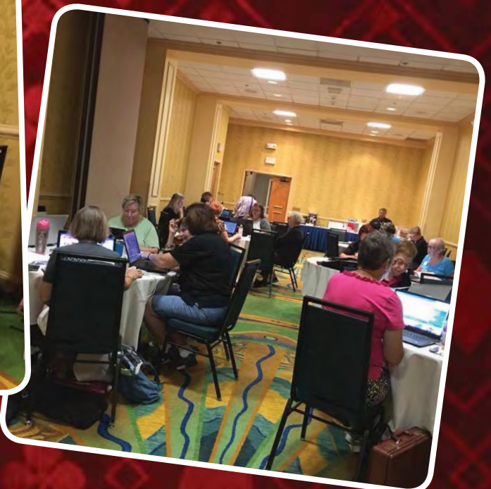
Boot Camp Chairmen Hard at Work