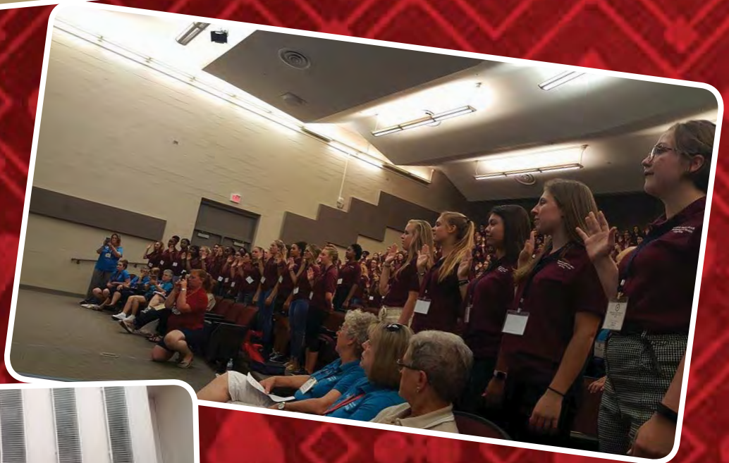
Girls State Oath