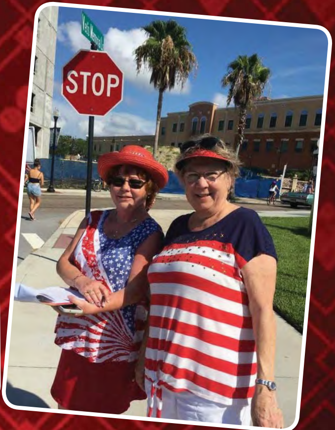
Unit 238 Safety Harbor Parade