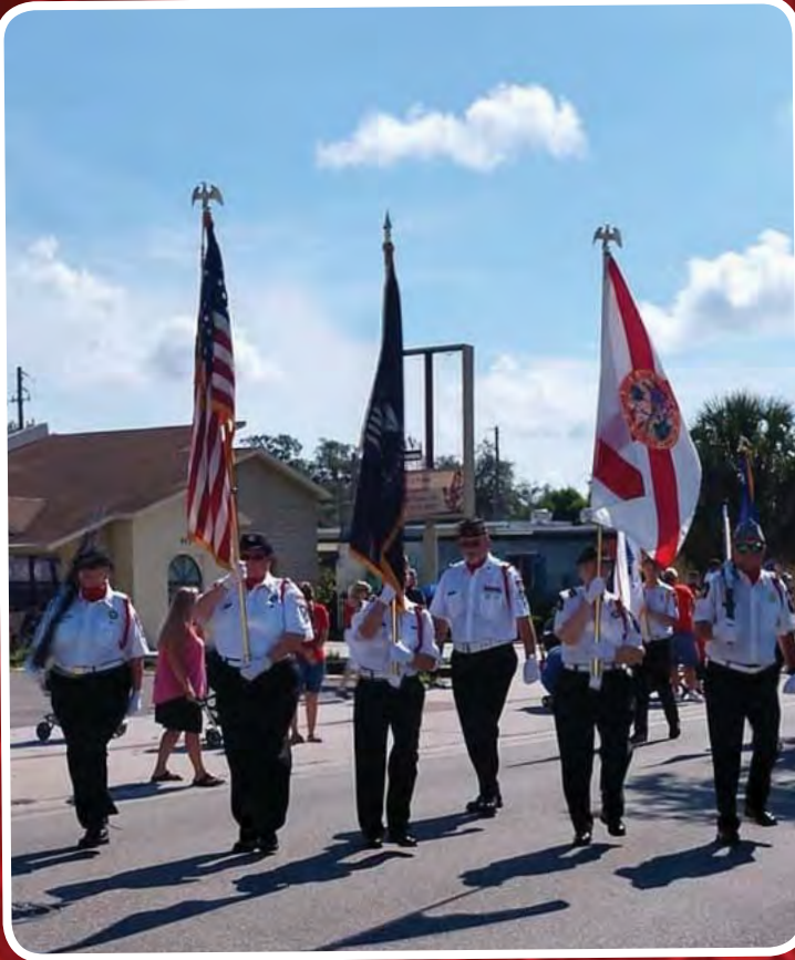
4th of July Parade