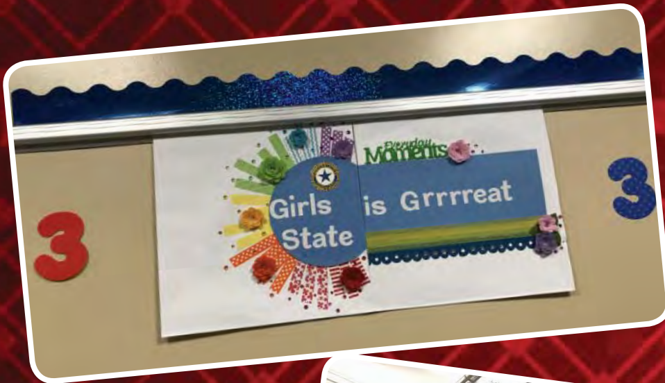
Girls State is Grrrrreat!