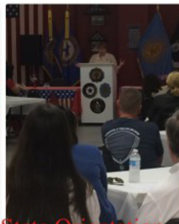
1st District Girls State Orientation