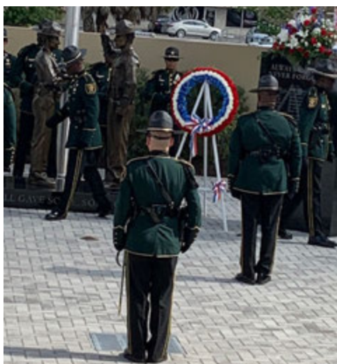
UNIT 273: Pinellas County Fallen Officer Memorial National Police Week