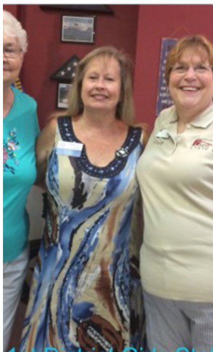
1st District Girls State Orientation