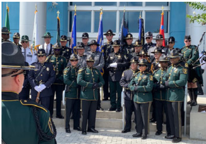
UNIT 273: Pinellas County Fallen Officer Memorial National Police Week, Pinellas Sheriff Offices in the Rotunda, May 9, 2019.