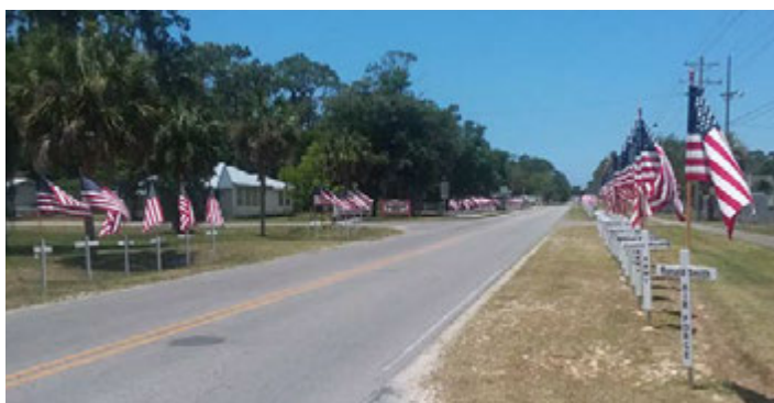
Unit 291: Steinhatchee is ready for Memorial Day. With the help of the Legionnaires, Son's of the Legion and residents of Steinhatchee 390 crosses were put up for Memorial Day week-end. This has been one of the best projects that the Auxiliary has put together in our small community.