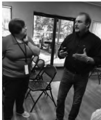
District 3: Visit