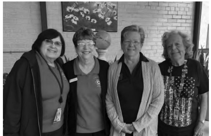
District 3: Lake City VMAC