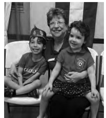
District 14: President's son and niece with Department President