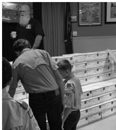
Unit 273: 155 packed boxes for the troops