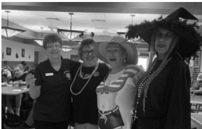
Halloween Party at Emory Bennett