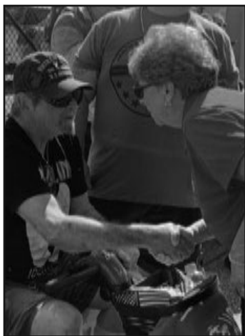
Town and Country Veteran's Day Parade