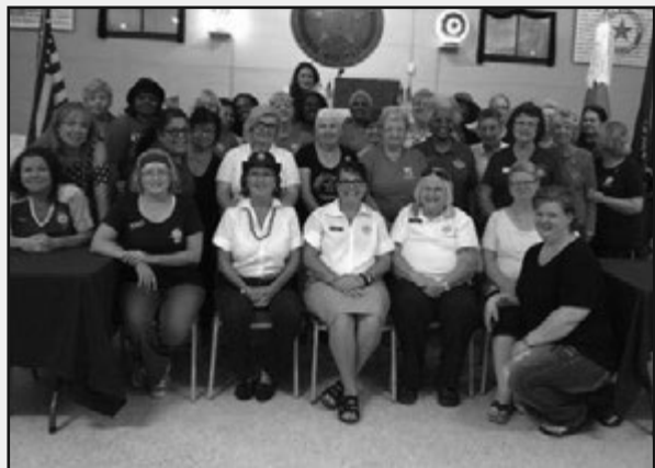
Our School of Instruction was a great success! Nine units attended.