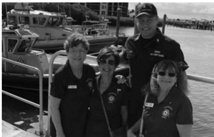
With U.S. Coast Guard