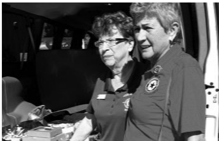
Mayport Naval Base to serve Thanksgiving Dinner to the Navy Personal and Families aboard the USS Roosevelt.