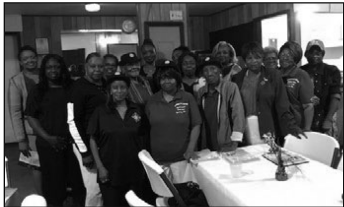
Unit 217: Unit 217 along with Post 217 Quincy hosting a "Meet and Greet" informal evening for membership.