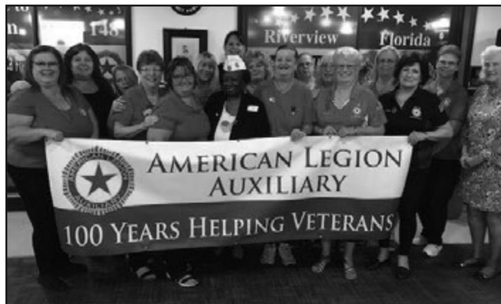
Riverview Unit 148