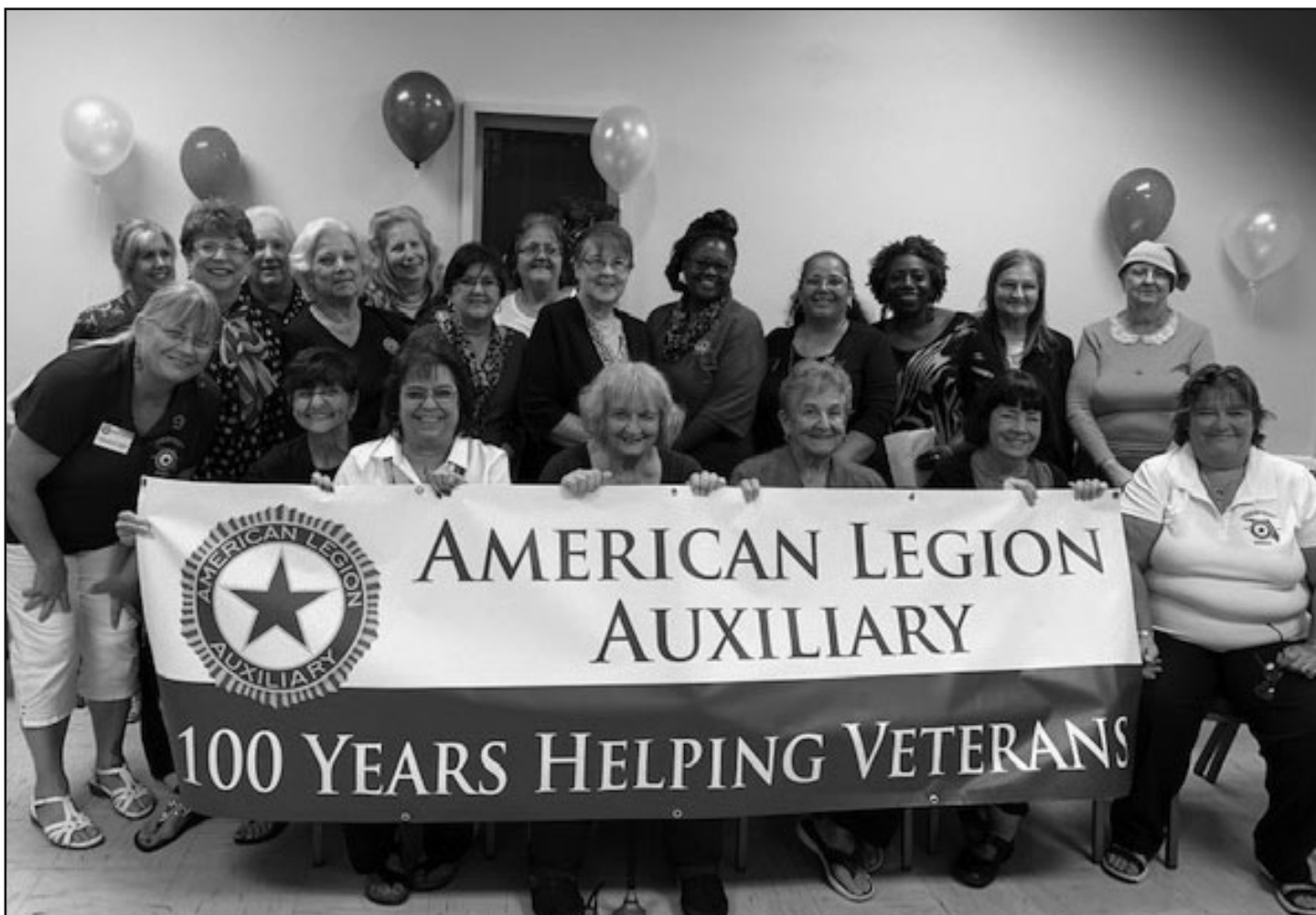
Tampa Unit 5 celebrates 100 years