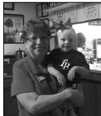
Celebrating 100 Years with the youngest member of Riverview Unit 148