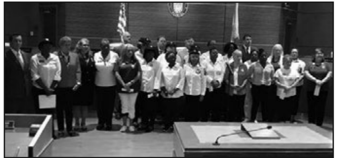
District 5: St. Augustine Unit 194 received a Proclamation from The St. Johns Country Board of County Commissioners for the 100th Anniversary of the American Legion Auxiliary.