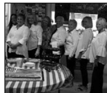
Unit 291: On Veterans Day November 11, 2019 the Veterans of Post 291 Steinhatchee was honored with a sit down dinner. The volunteers to make the event happen were members of the Son's of the Legion and the Auxiliary. Over 70 guest were served with a reception from 5-6 followed by dinner at 6:00. World War II Veteran was given a quilt made by the Auxiliary quilting group. A great night for all that attended.