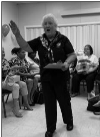
Membership fun with Unit 5