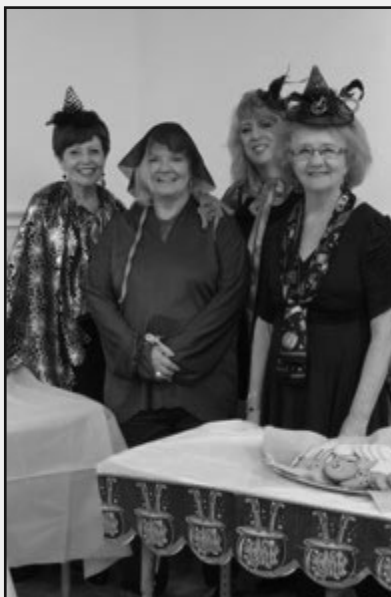
Units 65 Delray Beach, 47 Lake Worth, 199 West Palm Beach & 277 Boca Raton attended the CLC Halloween Party.