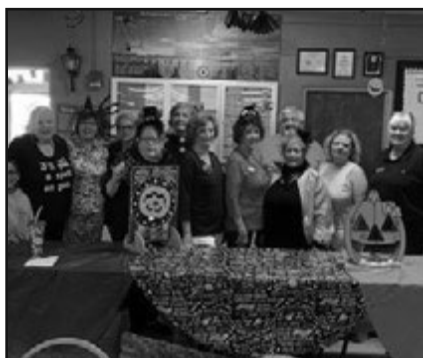
Unit 273: Children's Halloween party Saturday October 26, 2019