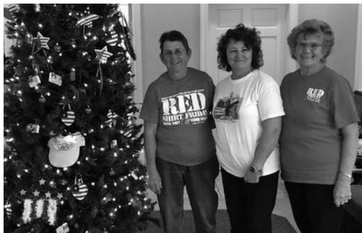
Memorial Unit 241 in Sneads decorated the Christmas tree at PeoplesSouth Bank in a patriotic fashion.