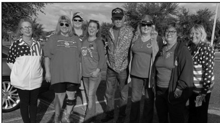
Joining members of Town and Country Unit 152 for the Veteran's Day Parade