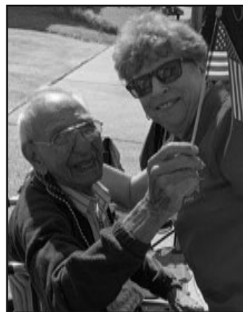
Town and Country Veteran's Day Parade