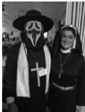
Unit 158: Post 158 and auxiliary Halloween costume party October 26, 2019. Thank you Liz