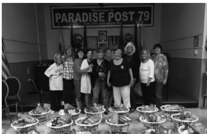
Unit 79 New Port Richey, 21 Thanksgiving Baskets for our veteran families