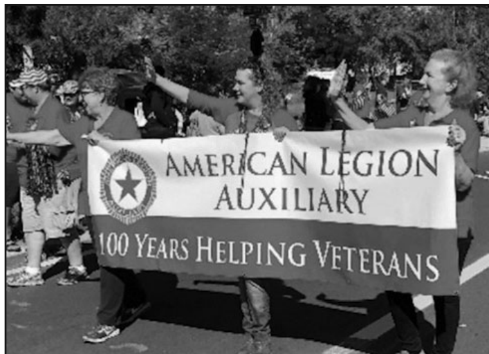
Proudly representing the ALA in the Town and Country Veteran's Day Parade