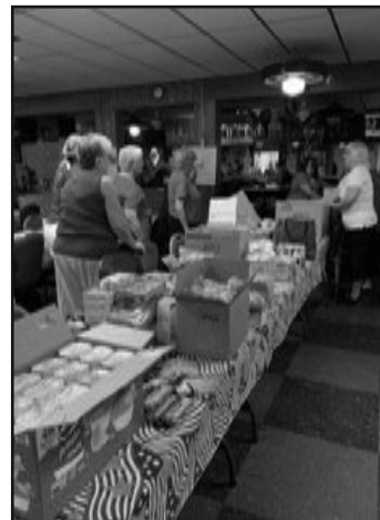
Packing troop boxes with Unit 186