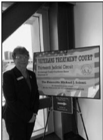
Attending Veterans Court in Tampa