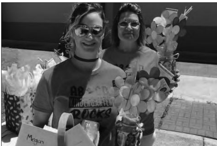
Unit 291: American Legion Auxiliary, Unit 291 of Steinhatchee participated in Teacher Appreciation Week. Each of the 7 teachers at the Steinhatchee School was given a 25.00 gift card to our local restaurant (Roy's). Pictures of teachers are attached.