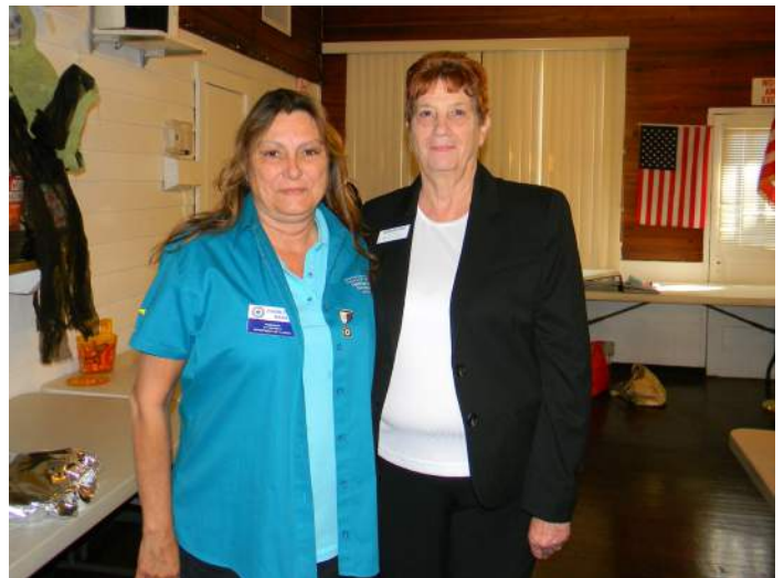
6th District ABC School