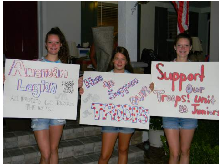
Unit 80 Juniors Yard Sale in support the American Legion.