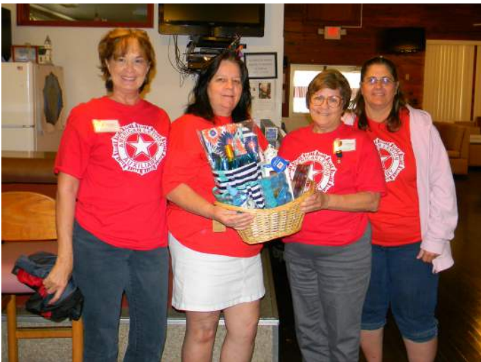
6th District ABC School