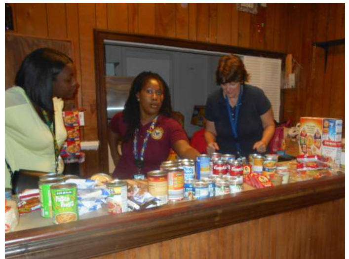
Members in the 15th District prepare food items donated or purchased with monies donated.