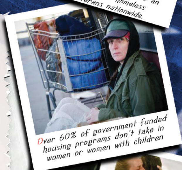
Over 60% of government funded housing programs don't take in women or women with children

Women Veterans have unique needs that cannot be addressed by existing programs that were designed for men.