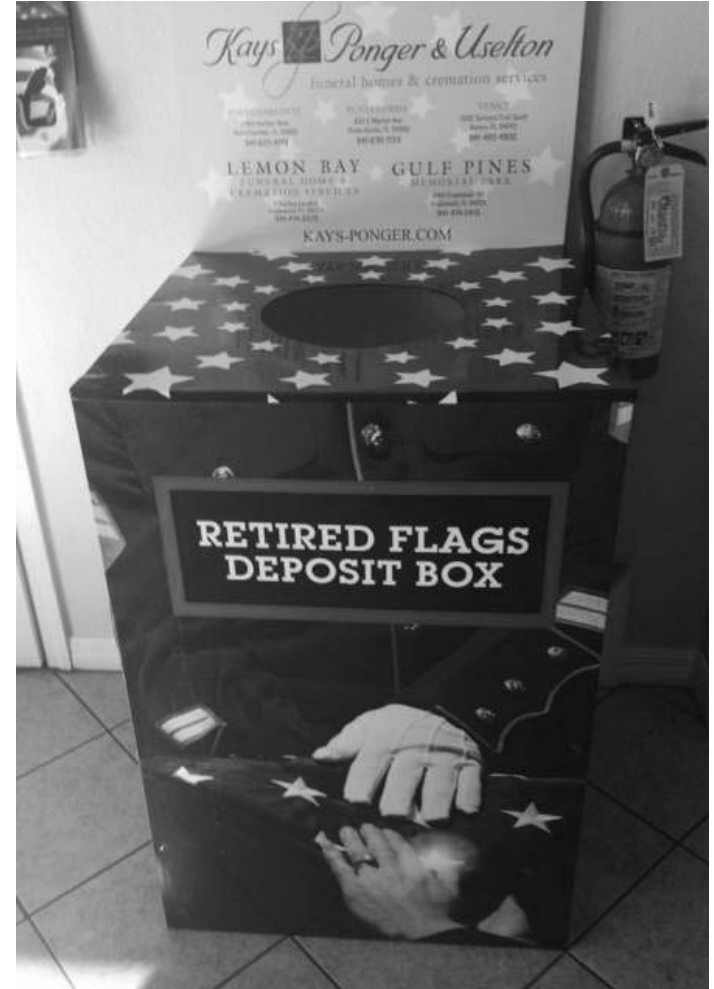
Our flags are dearly cared for.

Our Veteran's day celebration ended at the Post home with a back yard cookout for our local homeless veterans who were not only served a hot meal and treated with respect, but were presented 'freedom bracelets' by our Unit President as a show of thanks for their service.