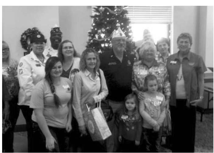
Department President and Commander vist Clyde Lassen VA Nursing Home on December tour with Unit Members from Units 37 and 194.