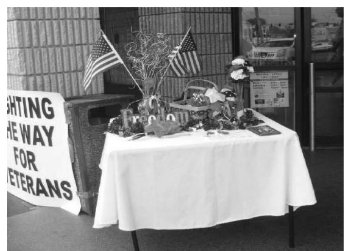
Poppy display at Winn-Dixie.