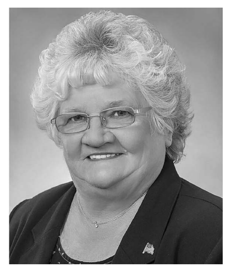
I hope everyone had a very MERRY CHRISTMAS and that everyone is healthy and safe.

Since our last Shining Beacon my travels have taken me many wonderful places and meeting such very enthused Auxiliary members. Elections were on everyone's mind and we wanted to help get people to the polls. Auxiliary members drove Veterans and neighbors to the polls and took them back to the home Post for coffee and doughnuts.