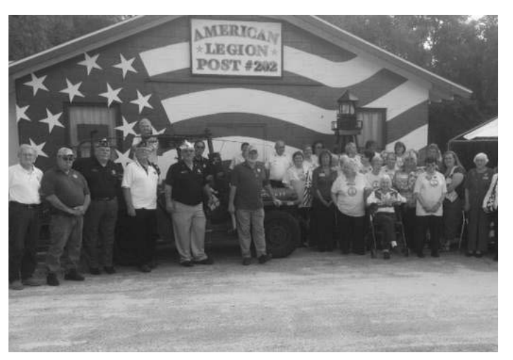
Enjoying friends at Post 202 in Keystone Heights on December 6.