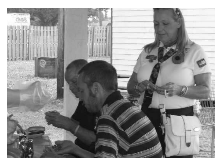
Honoring our local homeless Veterans.