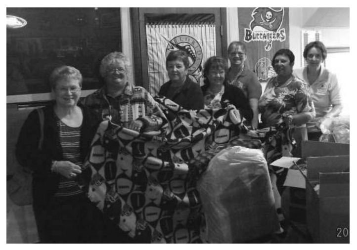
President Schwabe at Post 71